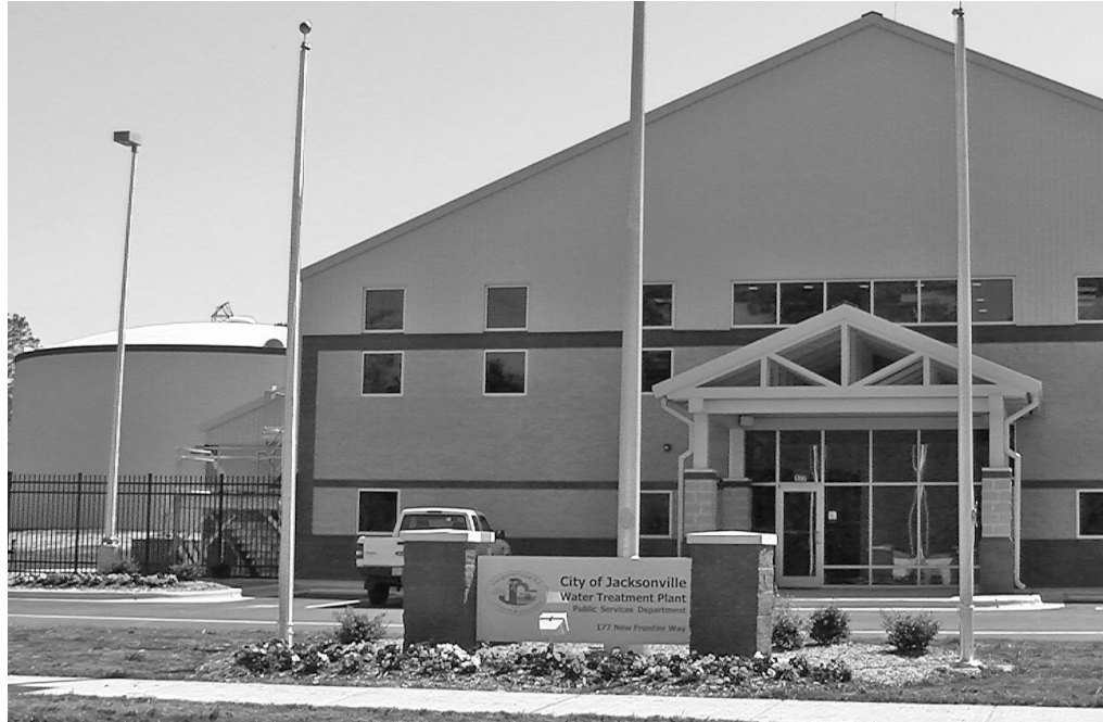
New Water Treatment Plant (right)

The relative susceptibility rating of each source for the City of Jacksonville was determined by combining the contaminant rating (number and location of PCSs within the assessment area) and the inherent vulnerability rating (i.e., characteristics or existing conditions of the well or watershed and its delineated assessment area). The assessment findings are summarized in the following table: